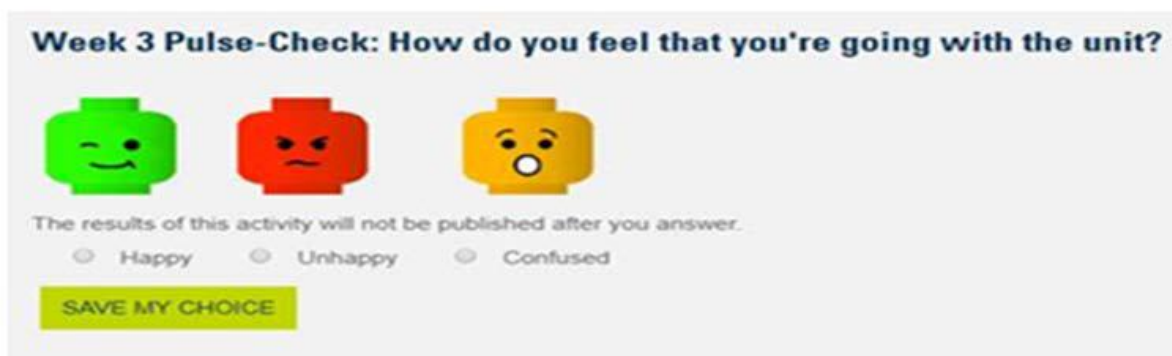
Figure 1: Examples of Adaptive and Progressive Digital Feedback for Students

It's clear from the literature that a problem exists with existing SES instruments, and that a more adaptive approach is needed. Based on the literature review, this new system needs to be easy for students and teachers to use, quick to implement, and provide feedback that can be quickly actioned in a real-time fashion. For this reason, this paper is proposing an adaptive and progressive feedback system that can collect multiple forms of feedback (or data) from participants to support meaningful understanding of the course content on a weekly basis. An example of the feedback design which will be used in this study is shown in Figure 1. The Shareable Content Object Reference Model (SCORM) framework, which is supported by many Learning Management Systems (LMS) and eLearning authoring tools, can be used as a scaffold for the creation of bespoke content to facilitate this approach.