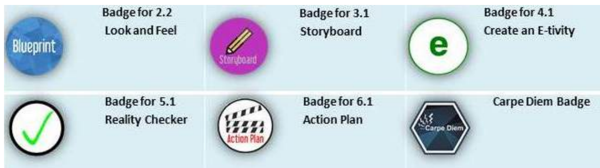
Figure 2: Visual representation of badges

It was possible for a participant to complete the CD MOOC without earning the badges. However the majority of those who completed also submitted their work to earn badges. Figure 2 shows the six badges participants received upon submission of their completed task. Participants could immediately display the first five badges in their CourseSites profile. The final badge (“Carpe Diem MOOC Completion Badge”), which was a Mozilla Open Badge ( www.openbadges.org ), could be displayed in a wide range of the participants’ online spaces.