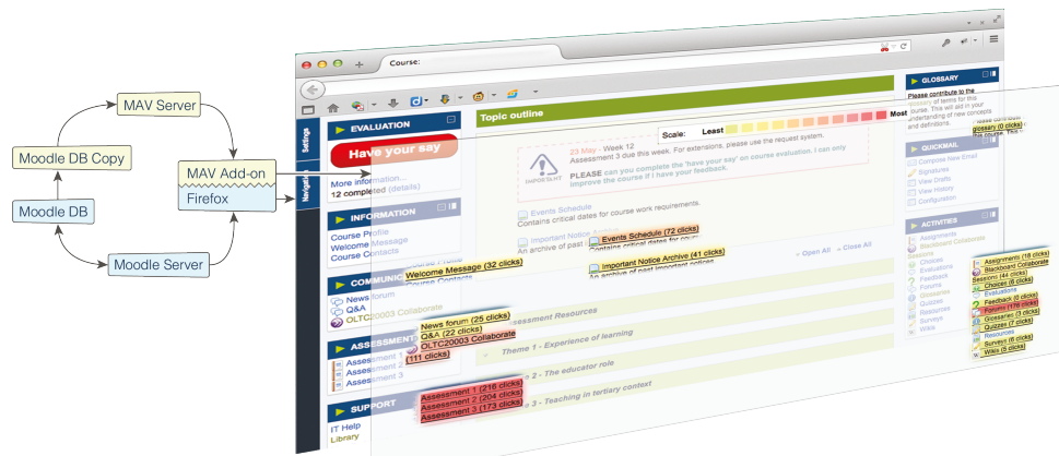
Figure 1: How MAV works

development in favour of more established “vanilla” systems (off-the-shelf with limited or no customisations). This new strategy made it unlikely that the MAV would be re-implemented directly within Moodle, and the augmented browsing approach might be viable longer term. As the MAV was being developed and refined, it was being tested by a small group of teaching staff within the creator’s team. Then in September 2013, the first official trial was launched making the MAV available to all staff within one of CQUniversity’s schools.