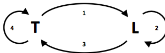
Figure 1: A simplified version of Laurillard’s (2002) Conversational Framework

Two areas of educational research and development underpin this project: Diana Laurillard’s (2002) influential conversational framework, and the field of learning design. Broadly speaking, the conversational framework proposes that the interaction, dialogue and feedback between teachers and students are critical to students’ learning processes and outcomes. A simplified version of the framework is presented in Figure 1. A generalised learning interaction begins (1) when a teacher [T] designs and presents material or an activity to learners [L] who then engage with this by acting upon it (2). Learners subsequently respond to the material or activity given their current understanding (3), often directly to a teacher. This is then reflected and acted upon by the teacher (4) before a new loop or cycle is initiated in which the teacher may choose to re-present the material or activity, remediate or provide learners with feedback.