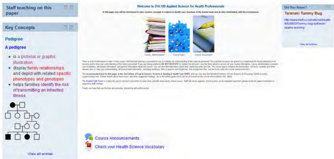
Figure 1: Sample of Key Concept location on the Stream site

A further development using the Glossary tool is designed to capture students' curiosity, and contains current updated science stories closely related to the individual topics students are learning. This aims at high end learners, who are likely to require extra relevant information within the course to sustain their active learning. This section will be updated each week of the course. By meeting a range of learning needs with the Moodle online environment, students will be more motivated and engaged in their learning process.