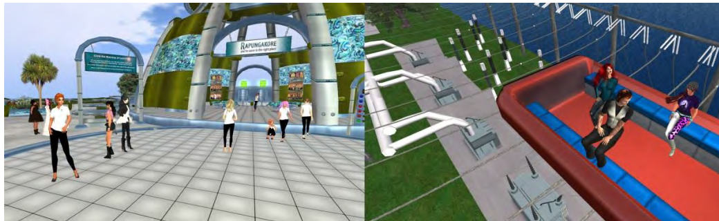
Figure 4: Health students preparing for their interviews (left) & engineering students touring the Areva NuclearPower Plant

Although 20 students actively participated in the VWC, only four students in Semester 2, 2012 and three students in Semester 1, 2013 were regular attenders. These students were asked to reflect on the experience of attending the club and whether they had benefitted in terms of the work they were doing on their projects. Students completed a Blackboard Survey which consisted of eight Likert scale questions, phrased both positively and negatively (the scale consisted of Strongly Agree, Agree, Partially Agree, Partially Disagree, Disagree, and Strongly Disagree). The data was automatically summarised by Blackboard and student comments remained anonymous.