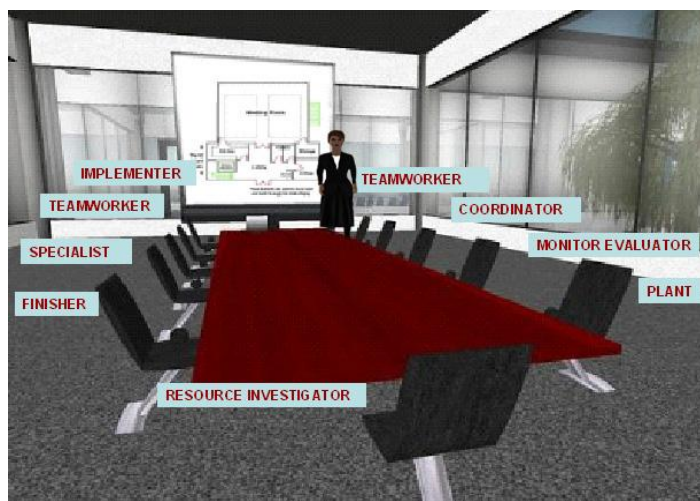
Figure 1: Screen shot mock up of proposed ‘Team Meeting’ scenario in the 3DVLE, indicating team roles (Belbin, 2010) that student avatars will be able to experience.

This paper reports on the Stage One of the overall investigation.