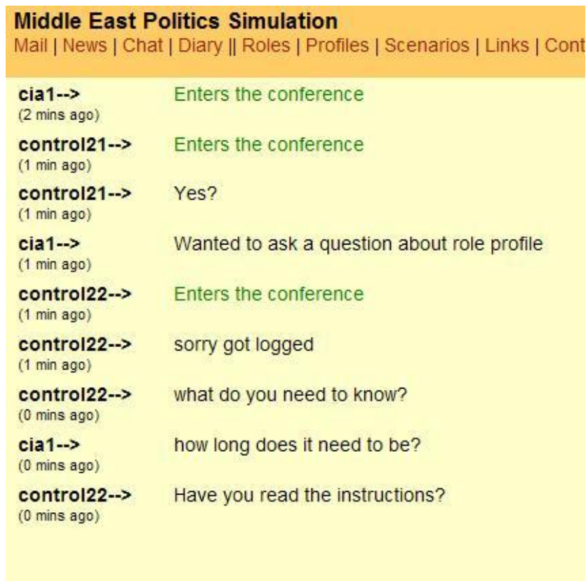
Figure 2: MEPS chat window showing broken session

There have also been some regular expressions of yearning to add Web 2.0 functions such as micro-blogging or Facebook-style updates and file sharing to the MEPS. Partially this stems from an assumption that students use these things in their private lives and therefore might expect their inclusion or that the availability of these things will make the MEPS more enjoyable for them. However, it increasingly needs to be considered that in a world where senior politicians and even terror groups make full use of the Internet to post their opinions or Tweet, such social media tools are now actually a legitimate aspect of simulating political discourse.