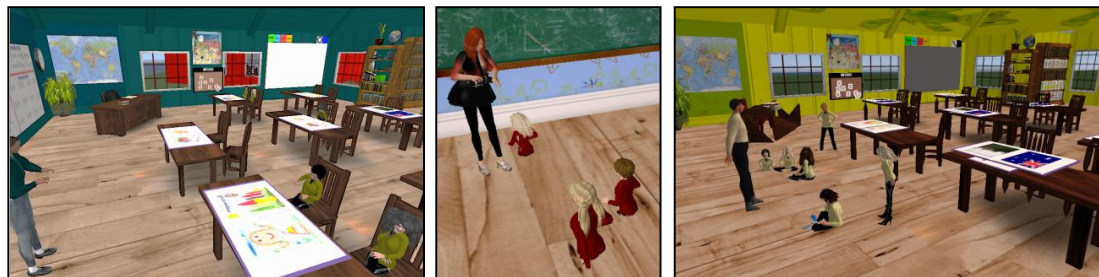
Figure 1: Pre-service teachers undertaking VirtualPREX role-play activities

to inform their role as the teacher. Peers, role-playing primary school students, were given their role during the workshop. These roles were designed drawing on the description of student behaviours that emerged during the focus group discussions. The role-plays that the students received were colour coded – pink/orange were “good” and blue/green were “naughty” students (see Table 1). This assisted in keeping the pre-service teacher on task as to which role to play and to easily swap if needed.