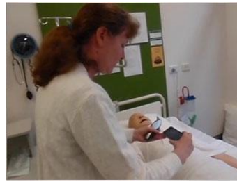
Figure 2: First-person learning in action

The video was captured in .3pg format which is suitable for viewing on a mobile phone, further, the file was converted to .mp4 for later deployment on a web page. It was important for the artefact to be short in duration (20 seconds or less) for delivery using a mobile phone as well as limiting transmission load if viewed over the Web.