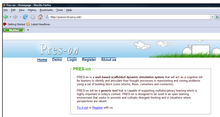
Figure 1: Interface login of PRES-on

Our initial design of PRES-on allows users to create their own ID and password to access the system, build and run their problem representation and store it on the server (see figure 1 for the interface). We also provide step by step guidance on how to use PRES-on. Users can expect more interactions with the system with the improved version of PRES-on when the different levels of prompts are configured into the system. This will allow the system to play the role of an "intellectual partner", facilitating the user's problem solving process.