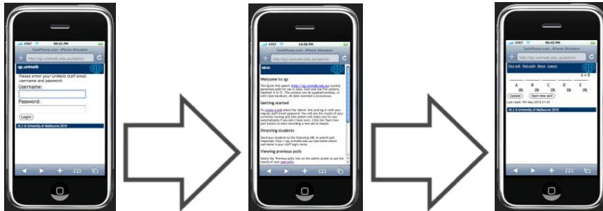
Figure 1: The sequence of screens in setting up and activating a Quickpoll poll

Setting up a Quickpoll staff account and preparing the system for use in classes simply requires the member of staff to use the browser on their phone or any computer to go to the qp.unimelb.edu.au site, login using their normal staff email username (staffusername) and password when prompted, click the 'Admin' tab on the opening screen and then click 'Start a new poll'. The account is ready to receive input.