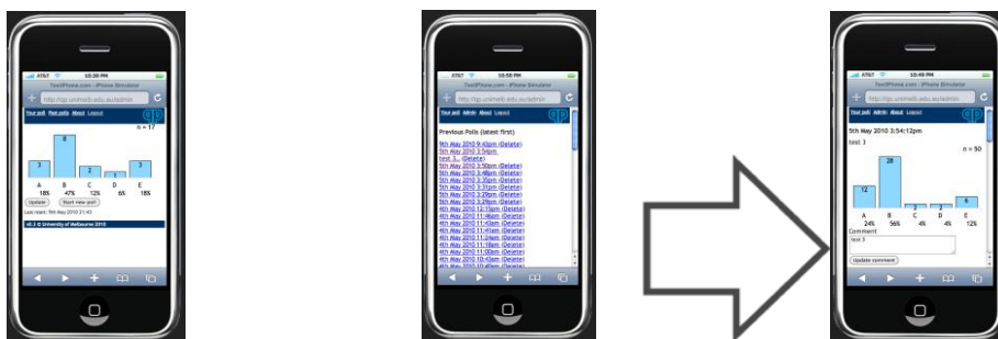
Figure 3: An iPhone view of a currently running poll and the sequence of screens to review a past poll

The response and reaction from staff and students in classes where Quickpoll has been used has been overwhelmingly positive. Over 95% of students in a preliminary evaluation survey ‘agreed’ or ‘strongly agreed’ with the statement that “Using qp.unimelb in class is a very useful way for me to obtain immediate feedback about my own knowledge and understanding of a topic in the context of the whole class”.