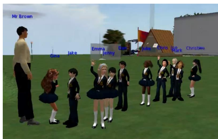
Figure 2: Demonstration of a virtual class being undertaken with teacher/student avatars

Finally, one student summed up their experience with the following: “Thanks so much for setting this up - it was hilarious and a lot of fun, as well as being educational. Really appreciate this opportunity”. Many learners throughout Australia and New Zealand have been provided with similar opportunities over the past 10+ years and each respondent would have very similar stories to share.