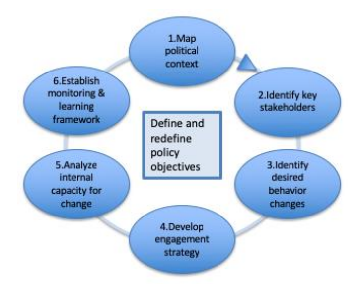
Figure 1. Adapted version of the ROMA model used by the SHIELA project (Tsai et al. , 2018) and by Hainey et al. (2018).

This was conducted through a series of semi-structured interviews, focus groups and workshops with members of the University Senior Leadership Team (n=12), Faculty Deans and Associate Deans, academic and professional staff of the University Faculties and Central Service Units (n=39), and students (n=6). The data collected was analysed along the six dimensions, of: (1) mapping of (political) context; (2) identifying key stakeholders; (3) identifying desired behaviour changes; (4) developing an engagement strategy; (5) analysing internal capacity to effect change; and (6) establishing monitoring and learning frame-works (as demonstrated in Figure 1). All data was validated by the LA roundtable group (see details below).