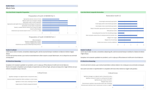
Figure 1: The dashboard breaking down assessment results