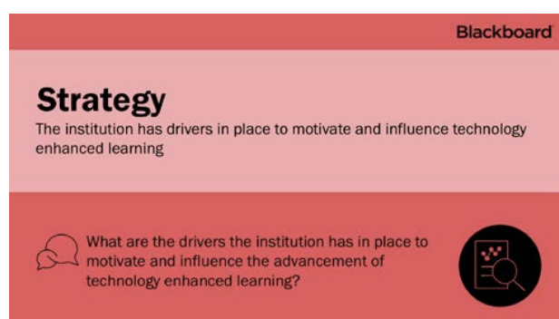
Figure 2: Front and back view of strategy theme card

The 8 theme cards have a similar visual design represented by a specific colour and icon. On the front of the card is the theme, a brief description and key question to be considered to help participants become familiar with the theme. On the back of the card (see example in Figure 2), guiding statements are provided to encourage deeper individual and collective reflection and discussion around institutional successes and challenges. There is space for individual comments and a square box to make an overall individual judgement on whether the theme is an overall success or challenge. In this way, these 8 theme cards have been developed to scaffold each theme to trigger discussion, reflection and a prioritisation process.