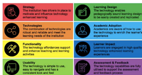
Figure 1: The 8 themes used in the TEL Framework

At the time of writing, an additional theme, making a total of 8 interrelated themes were used in the TEL Framework. There were ‘strategy’, ‘Technologies’, ‘Functionality’, ‘Usability’, ‘Learning design’, Academic Adoption’, ‘Learner Impact’ and ‘Assessment and Feedback’ (see Figure 1). This section provides a short justification for each theme.