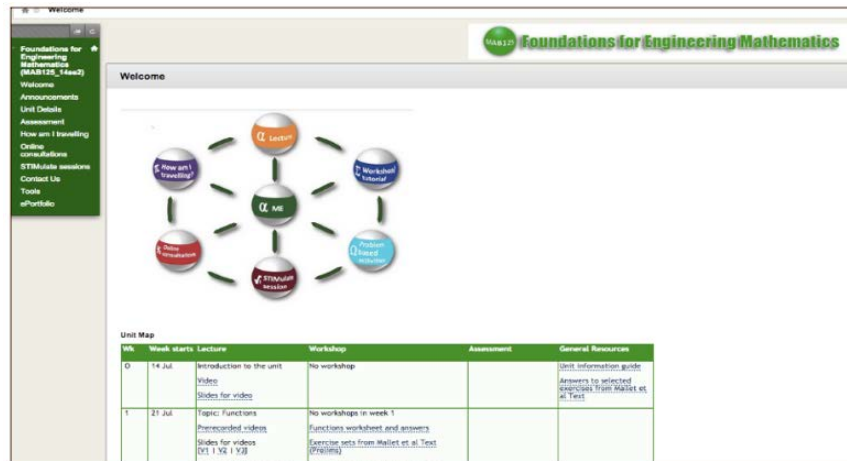
Figure 2: Blackboard site screenshot bottom of the page